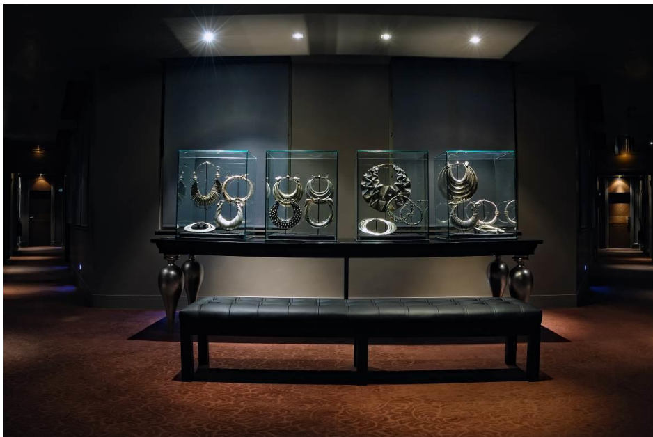
Display of Chinese jewels in the Banke Hotel

The hotel showcases a stunning collection of ethnic jewels, sculptures and art pieces from different collections and civilisations in each floor, communal space and even in the rooms. On display there are distinctive pieces coming from Papua New Guinea, China, India and Tibet to ancient African tribes. The collection also includes spectacular jewels and garments of great anthropological value, such as ritual necklaces from Papua New Guinea, silver and ivory bracelets from Sri Lanka, shaman dresses from Ivory Coast or the talisman boxes from the Mali desert.