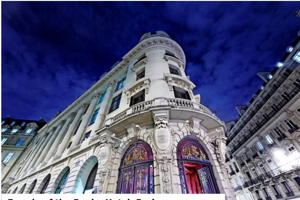
Façade of the Banke Hotel, Paris

This top 5* qualification given to Banke Hotel in Paris by ATOUT FRANCE, the French Tourism Development Agency, evaluates the quality of services provided by the hotel, along with the comfort of the premises, the customer service and its environmental policies in a setting full of art and history.