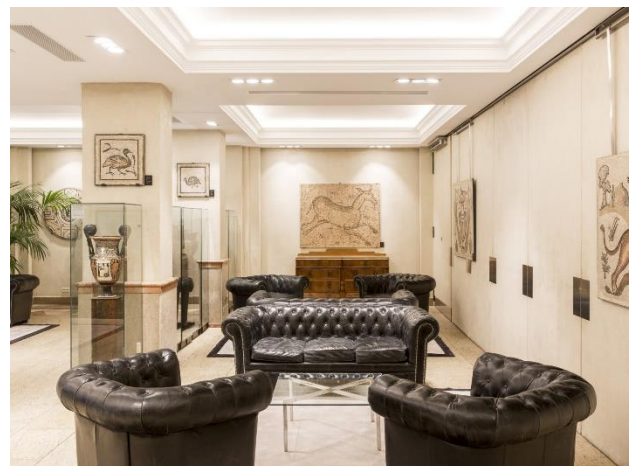
Collection of Roman Art and Mosaics Hotel Villa Real 5

Madrid, April 2024- World Art Day is celebrated on 15 April and Derby Hotels Collection offers you the chance to enjoy the exclusive art collections housed in its hotels in Madrid, Barcelona, Paris and London.