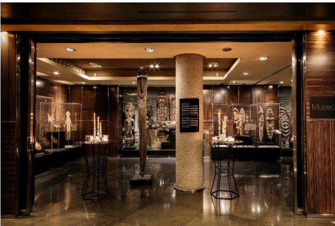
Hotel Urban 5*GL Museum Room