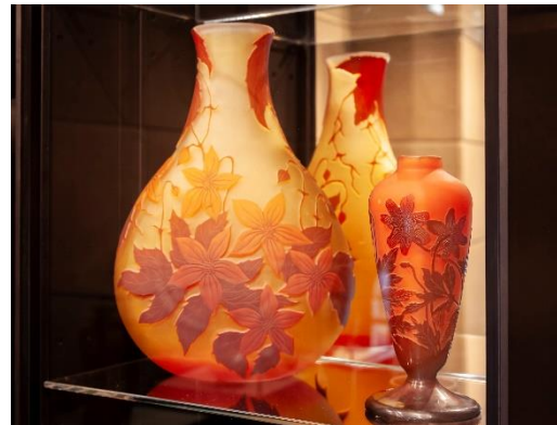
Carved and acid-etched glass vases from the "Jewels of Art Nouveau" collection

Located in the heart of Barcelona's Las Ramblas, the 5* Hotel Bagués has been deeply linked to the city and Modernisme through art, standing as a tribute to the Art Nouveau that made Barcelona one of the world's greatest cultural capitals.